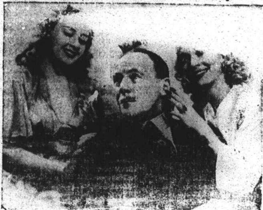
Joan Blondell, Roland Young and Carole Landis are three of the starring players in Hal Roach's, "Topper Returns," showing at the Imperial Theatre Monday and Tuesday.