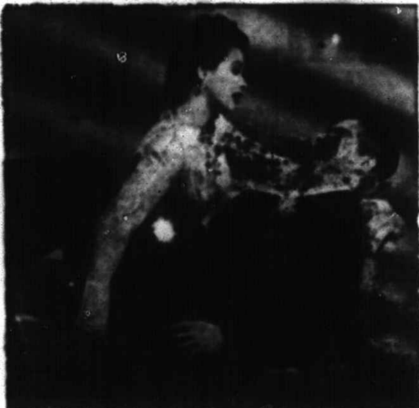
Diana Barrymore and Robert Cummings, appearing in "Between Us Girls," showing at Imperial Theatre next Monday and Tuesday.