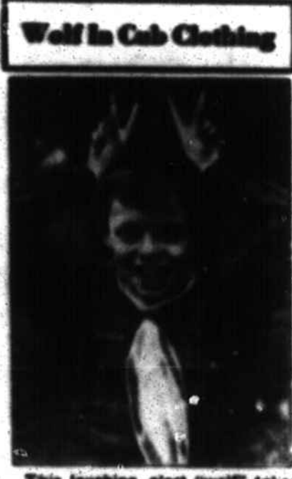
This laughing scout "wolf" takes his make-believe to heart in the imagination-stretching GUBBING program of the Boy Scouts of America for boys 9, 10 and 11 years.