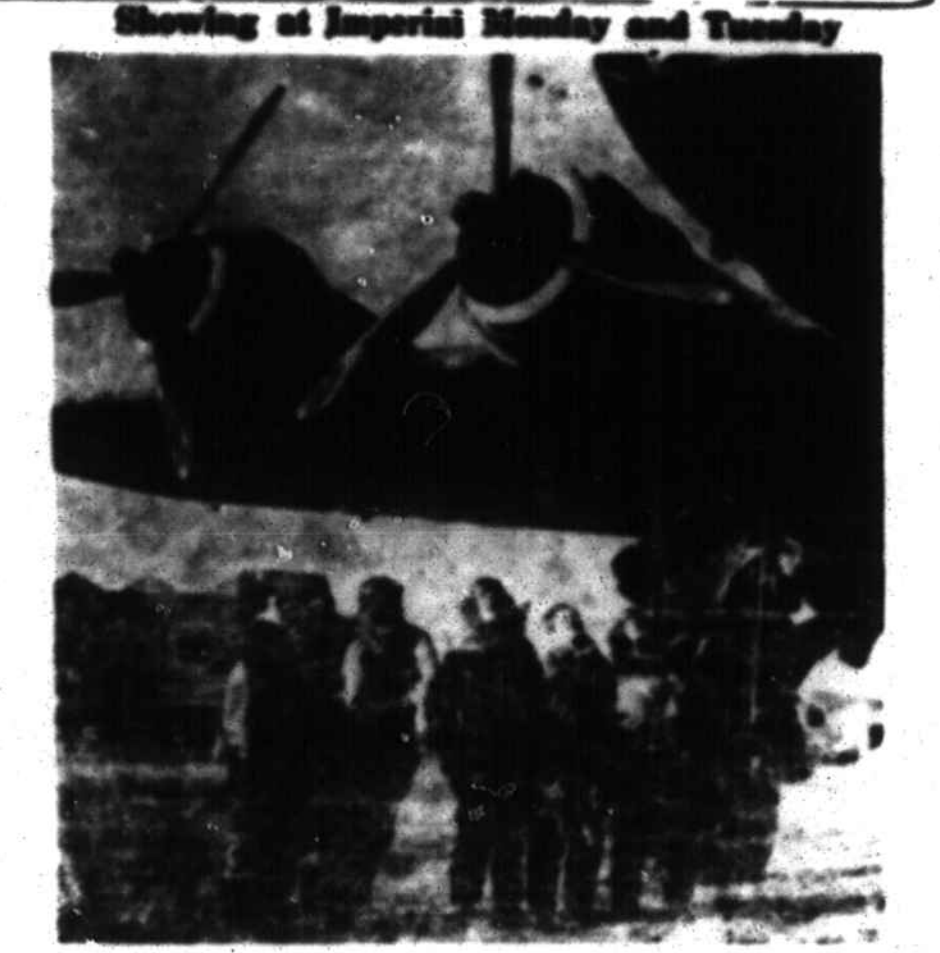
"One Of Our Aircraft Missing," showing at the Imperial Theatre next Monday and Tuesday.