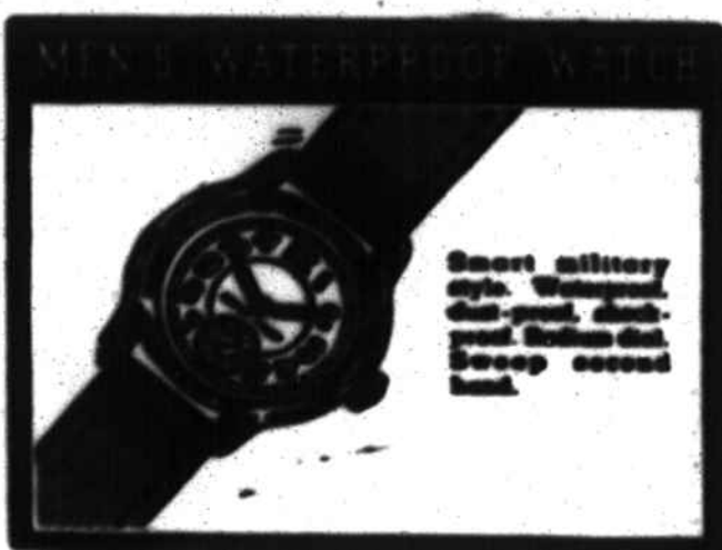
Smart military style. Waterproof, dust-proof, shock-proof. Nylon strap. Sweep second hand.

DELLINGER'S JEWEL SHOP King Mountain, N.C.