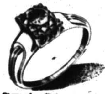
Diamond solitaire ring of classic simplicity and enduring charm.