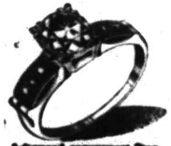
3-diamond engagement ring... the ultimate in good taste.