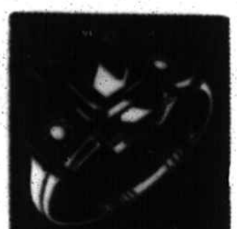
Superb 3-diamond solitaire ring for ladies. Choice of brilliants.