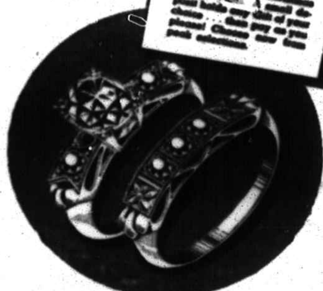
A captivating diamond bracelet. One of sparkling beauty and perfect harmony of design. Both things.

CHOOSE YOUR GIFT ON OUR LAY-AWAY PLAN Here's the easiest, simplest method to your Christmas Gift buying. A small deposit holds any gift of your choice. Then pay as you please. Choose now the best selection.