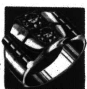
Stunning 3-diamond ring for men; superbly styled in 14K gold.