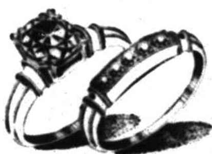
Stunning diamond solitaire with matching 3-diamond weddingband. Both.