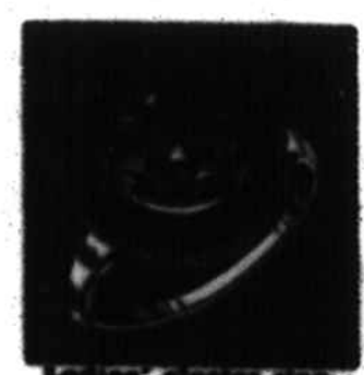
Ladies' diamond ring. Glorious classic style. Choice of brilliants.