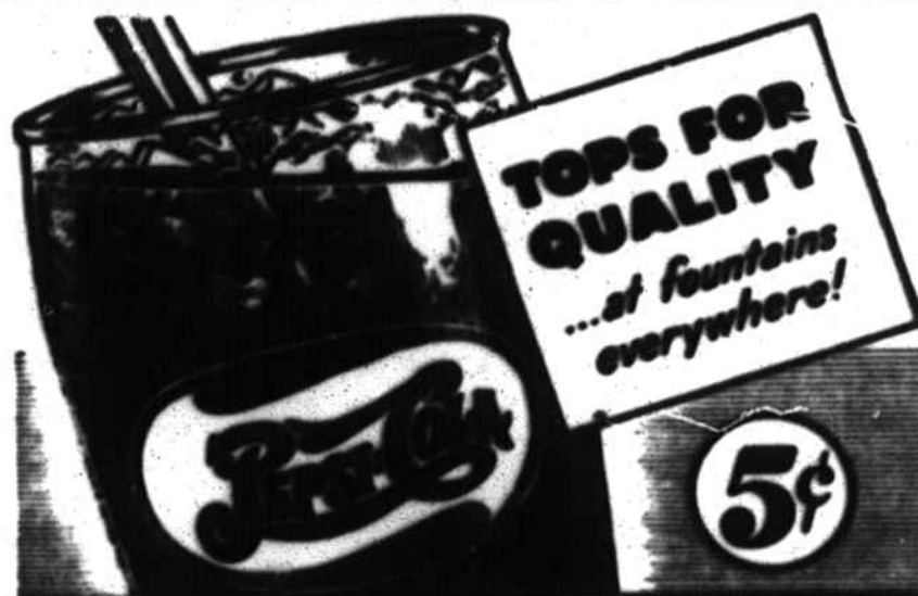
Pepsi-Cola Company, Long Island City, N. Y. PEPSI-COLA BOTTLING CO. OF CHARLOTTE, INC.