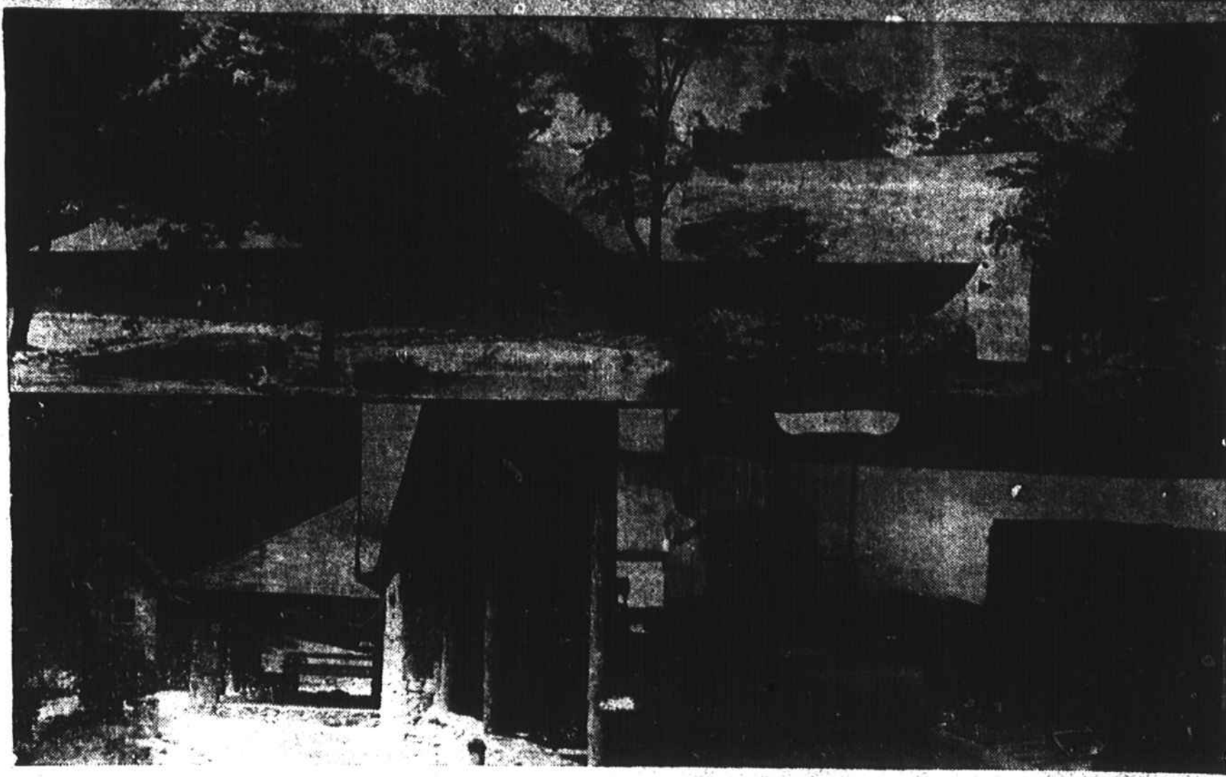
NEW DINING HALL AT PIEDMONT SCOUT CAMP—Shown above are views of the new dining hall at Piedmont Boy Scout Camp at Tryon, N. C., which replace the one destroyed by fire early this summer. At top is a view of the dining lodge and kitchen. At bottom right is shown the spacious kitchen which is equipped with ultra-modern cooking equipment, using steam and gas, and at bottom left is a view of the dish-washing and sterilizing section and boiler room.

Behind Your Bonds Lies the Might of America