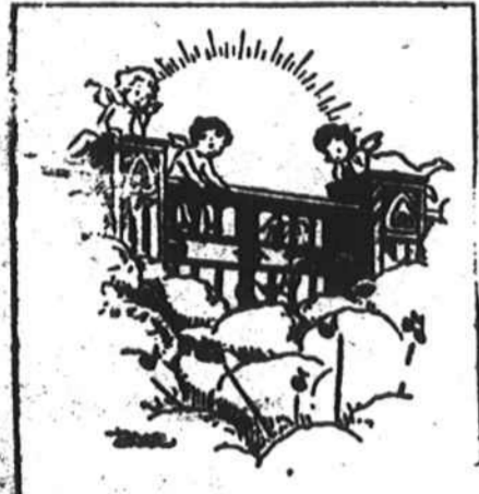
"Slight Breeze brings you Guy's bundle - 'The sweetest truck this side of heaven.'"