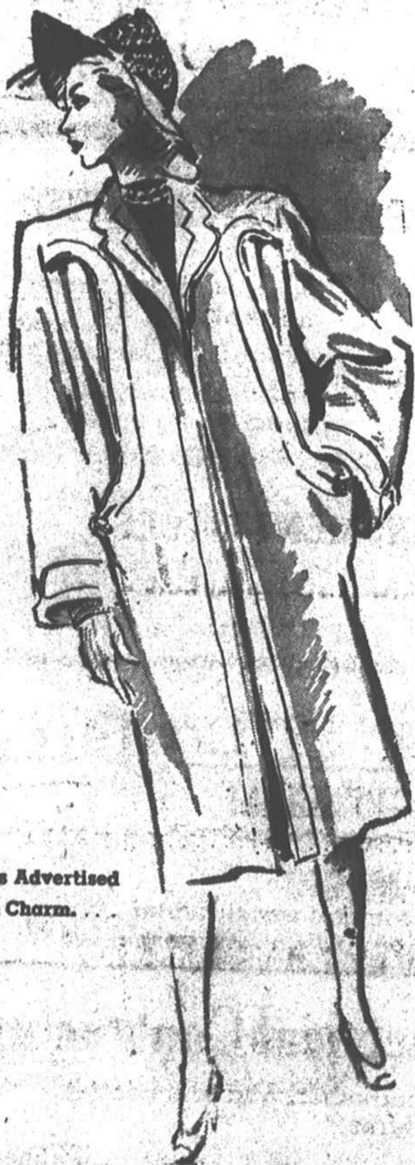
As Advertised in Charm...