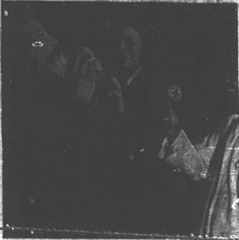
In the American Club in North China, this young U. S. marine told the Red Cross girl he was hungry enough to eat a bear. She provided a 16-decker sandwich instead.