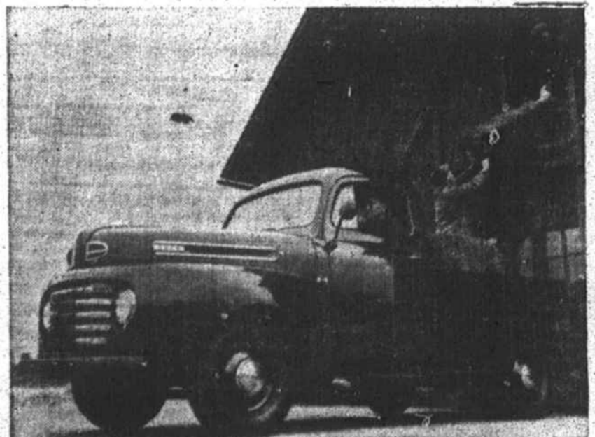
The new 1948 series F-1 Ford 1/2-ton truck has a 114-inch wheelbase with 6 1/2-foot pick-up body. The new trucks offered in 1/2-ton, 3/4-ton, 1-ton, 1 1/2-ton, 2-ton, 2 1/2-ton and 3-ton capacities provide a wider range of models and capacities than ever before, including the F-7 and F-8 series—the largest trucks Ford has ever built.

THEY'RE BUILT STRONGER TO LAST LONGER —Bonus Built, with the extra stamina that has always made Ford Trucks a better buy for any business. And among the many separate variants of chassis, engine, wheelbase and body available, there's the just-right Ford Bonus Built Truck for your business!