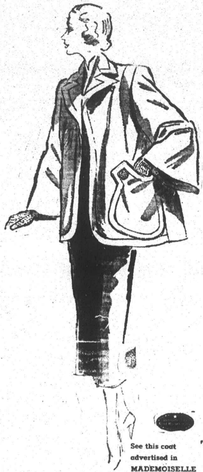
See this coat advertised in MADMOISELLE