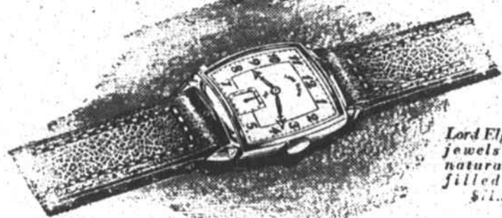
Lord Elgin. 21 jewels. 11K natural gold filled case. $71.50*

A new thrill in the Elgin gift tradition!