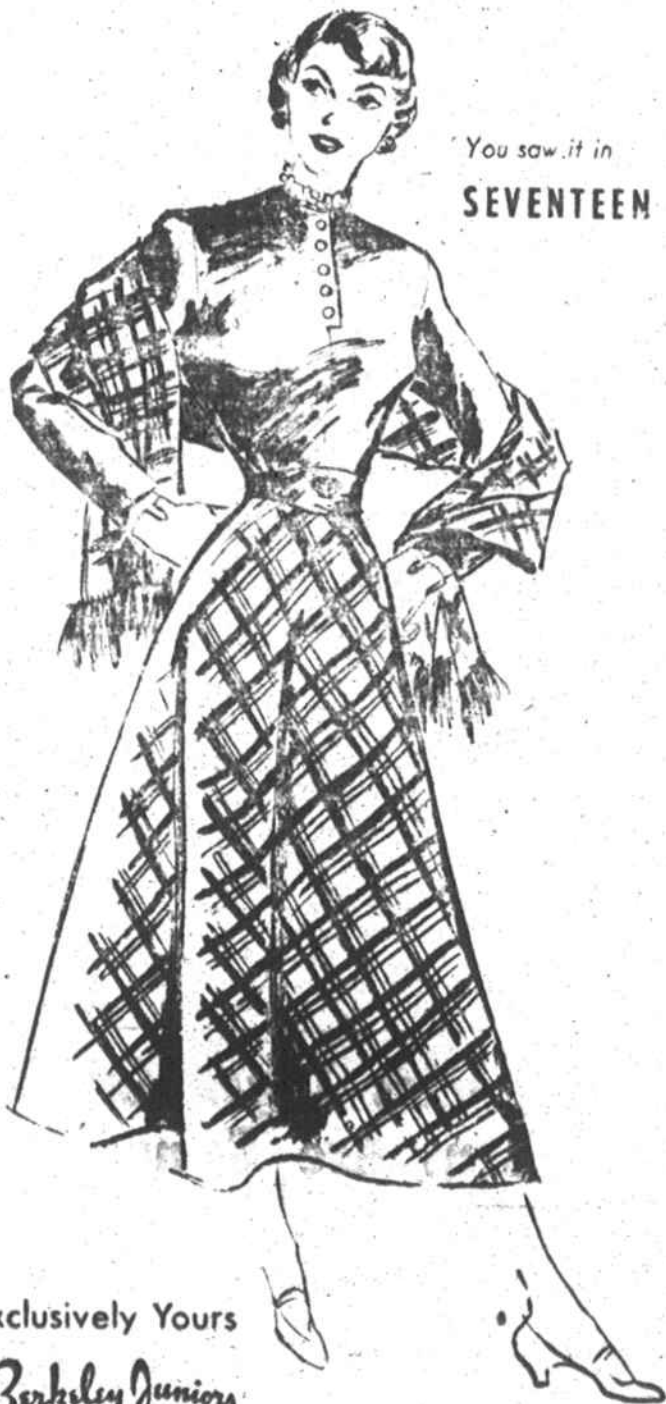
You saw it in SEVENTEEN