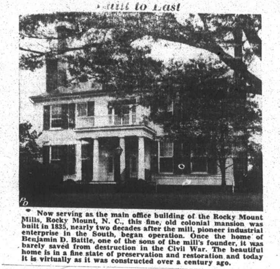
Mill to Last Now serving as the main office building of the Rocky Mount Mills, Rocky Mount, N. C., this fine, old colonial mansion was built in 1835, nearly two decades after the mill, pioneer industrial enterprise in the South, began operation. Once the home of Benjamin D. Battle, one of the sons of the mill's founder, it was barely saved from destruction in the Civil War. The beautiful home is in a fine state of preservation and restoration and today it is virtually as it was constructed over a century ago.

ORDERS PROMPTLY FILLED — all size covered buttons, buckles, and tailored belts. Samples shown. See Mrs. Ben Logan, 907 W. Mountain St., Phone 204-M. s-3-tfn