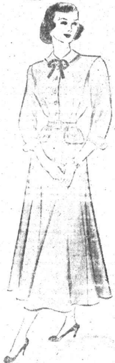
Designed for every figure... priced for any budget, in smart gabardine. Fashioned in grey, red, green, brown, royal, aqua, beige. Sizes 12 to 20 $14.95, Sizes 38 to 46 $15.95

BELK'S DEPARTMENT STORE Remember—You Always Save at Belk's