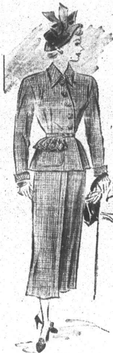
A slim, elegant suit-dress of soft wool and rayon in green, brown, wine, royal and elephant grey. Sizes 12 to 20. $17.95