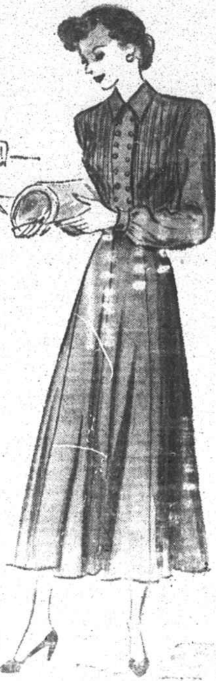
Designed in the classical lines of simple distinction... copper, brown, green, grey, wine, royal and black rayon crepe. Sizes 12 to 20 $15.95