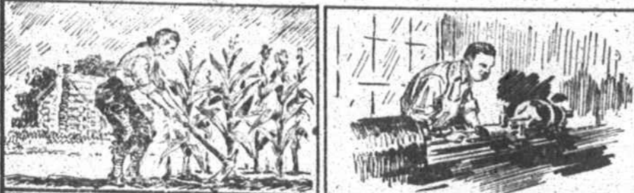
— INDUSTRY AND INITIATIVE

SINCE COLONIAL DAYS IN AMERICA, TO BE CLASSED AS "A GOOD PROVIDER" HAS BEEN A MARK OF DISTINCTION IN THE COMMUNITY. THE TERM IMPLIES: