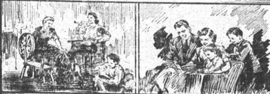
— A STRONG SENSE OF FAMILY TIES AND RESPONSIBILITIES