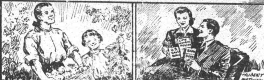
— THRIFT AND FORESIGHT

THE GOOD PROVIDER, BY VOLUNTARY ACCEPTANCE OF THE RESPONSIBILITY FOR THE ADVANCEMENT AND SECURITY OF HIS FAMILY, HAS ALSO CONTRIBUTED TO THE ADVANCEMENT AND SECURITY OF THE NATION.