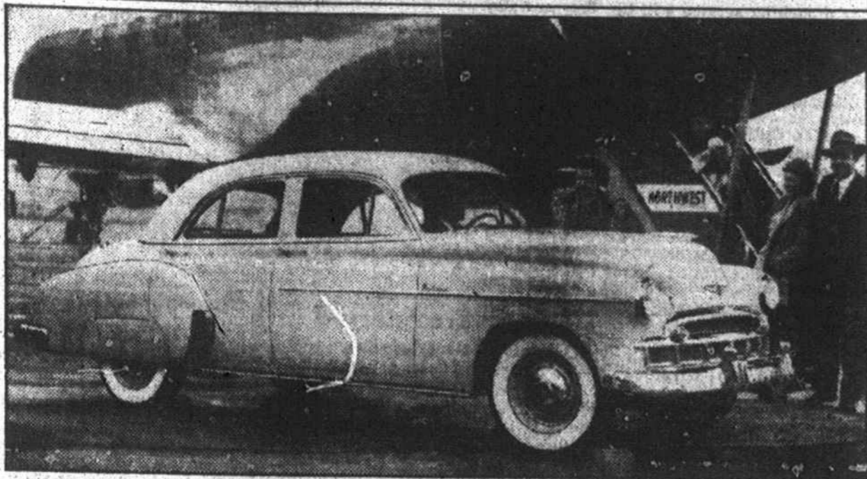
Progressive streamlining of the 1949 Chevrolet is in emphasis in this view of the Styleline De Luxe four-door sedan against a new Martin 202 passenger air-liner. Notable in the roomier, lower cars is a balance in design that adds greater comfort and driving ease as well as smart appearance.