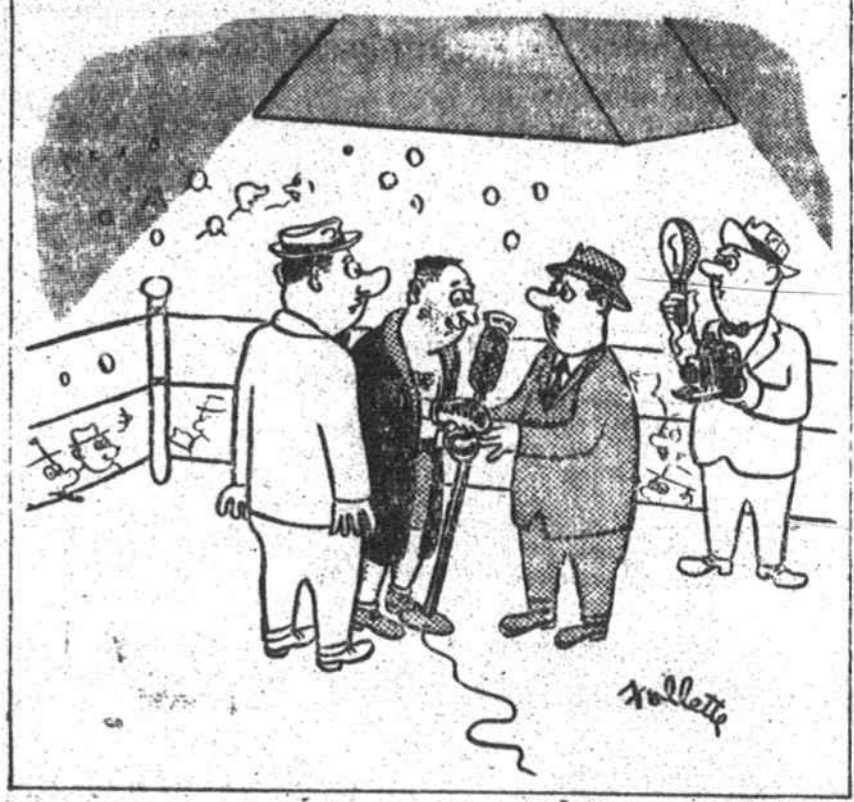
"And I want to thank my grocer for recommending HOLSUM Vitamins Enriched Bread"