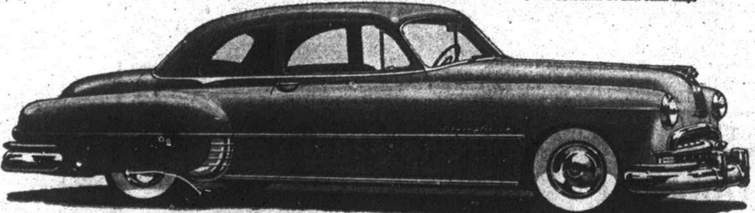
Chieftrain De Luxe Sedan Coupe