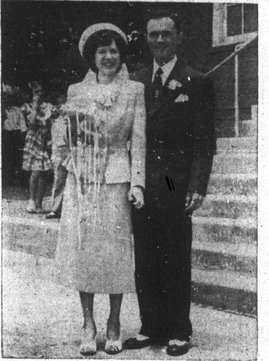
1900 thru 1921 was represented. A married in the Second Baptist church Sunday.