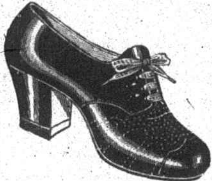
Black Kid Medium Heel With Arch Support