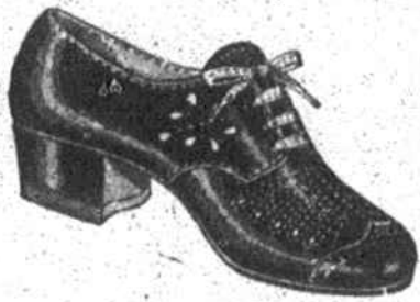
Black Kid Low Heel With Arch Support