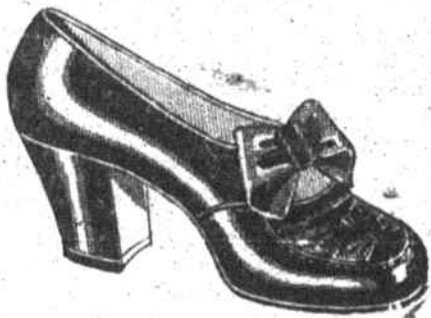
BLACK KID PUMP Medium heel — with Arch Support.