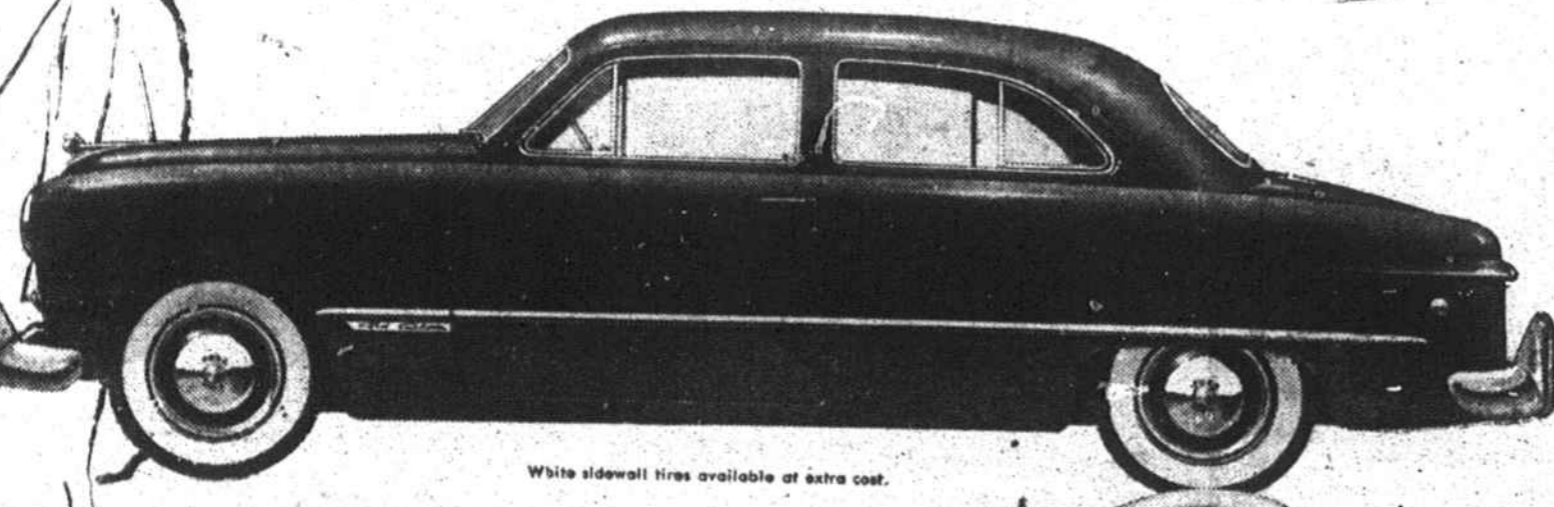
White sidewall tires available at extra cost.