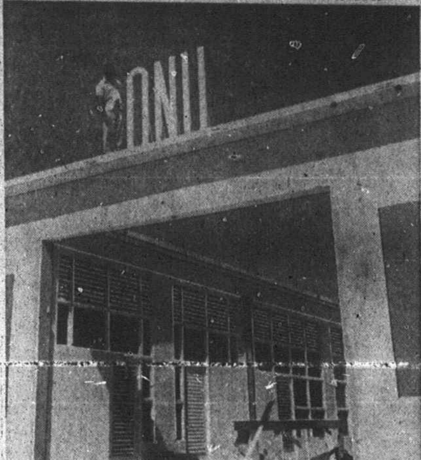
Thousands of persons from all over the world are expected this year to visit the International Exposition at Port-au-Prince, Haiti, to commemorate the two hundredth anniversary of the founding of that city. The exposition features a special United Nations exhibition, dramatizing the activities of the world organization. Above is one of the U.N. pavilions under construction in the Haitian capital.