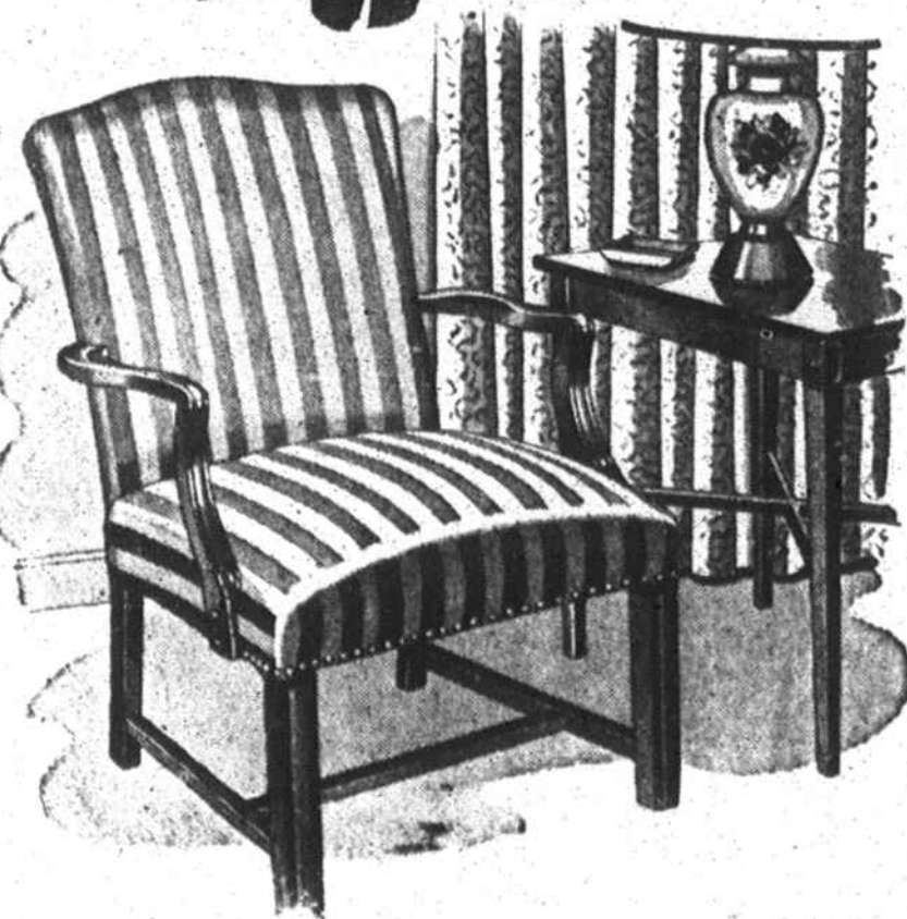
Chinese Chippendale Regularly $24.95 $14 95 95c Down!