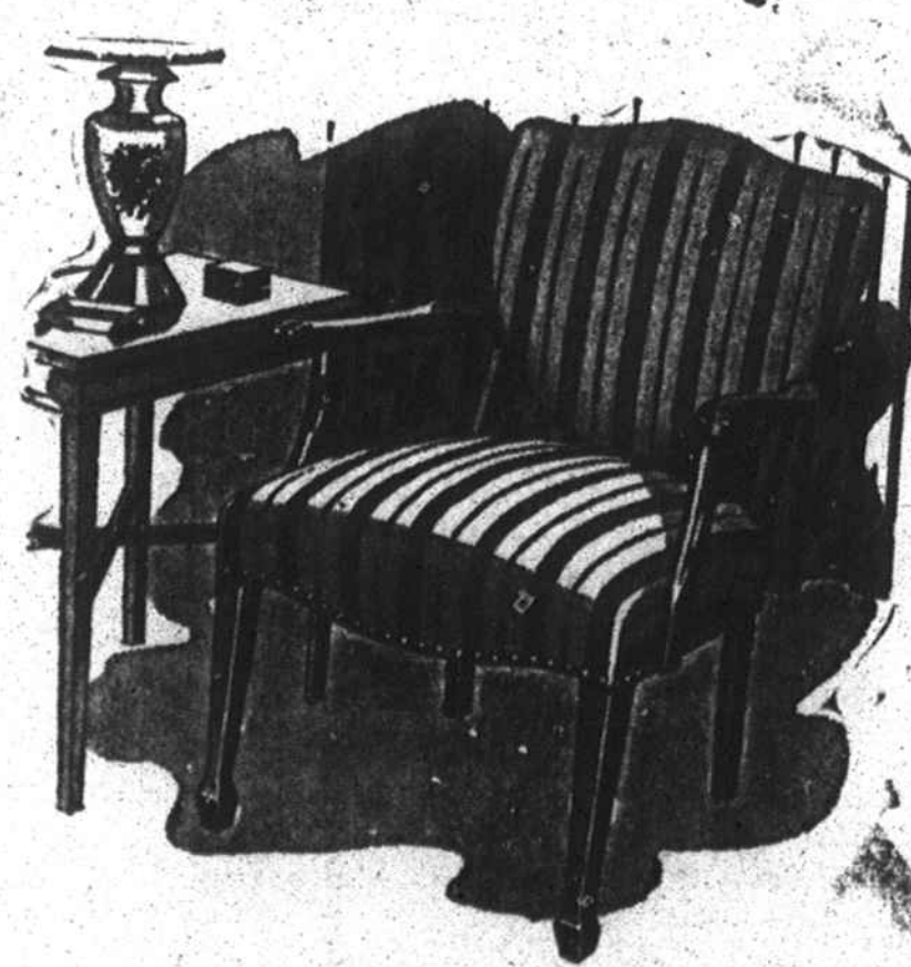
Spade Foot Chair Regularly $24.95 $14 95 95c Down!