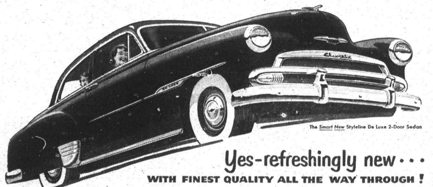
The Smart New Styleline De Luxe 2-Door Sedan

AMERICA'S LARGEST AND FINEST LOW-PRICED CAR!