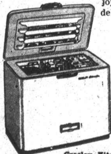
Crosley Kitchen Freezer SCF-8. Capacity 8.2 cubic feet — stores up to 287 pounds of frozen foods. Flat top gives you more than ten square feet extra work surface. Eight beautiful new Crosley Freezers — up to 20-cubic foot capacity.

DO PLAN TO BE THERE ... and to bring your friends!