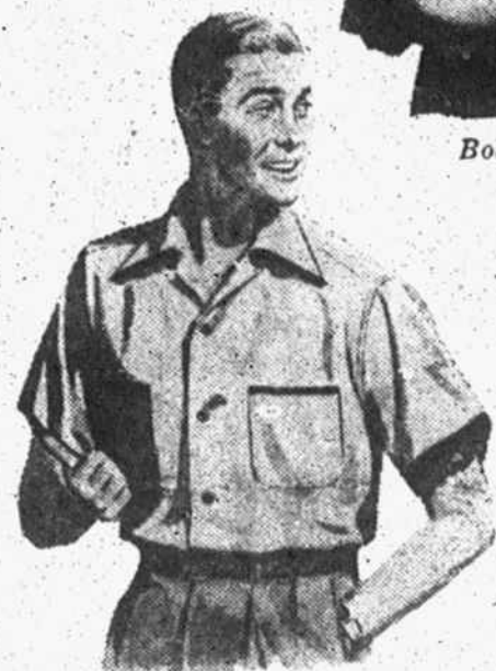
Spun rayon with contrasting trim on collar, cuffs and pockets $3.95