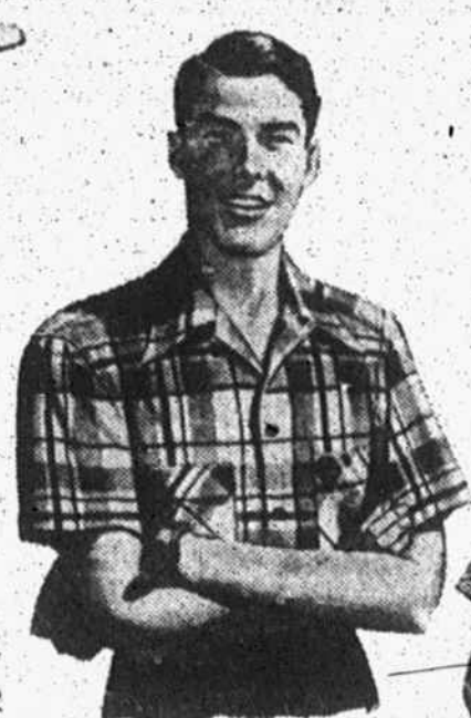
Bold-plaid gingham $2.95