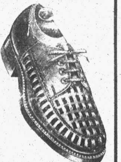
Sport Blucher $9.95