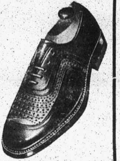
Beige & Brown $9.95