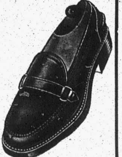
Brown Loafer $9.95