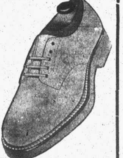
White Buck $7.95 Other White Bucks $9.95