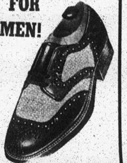
Nylon Mesh $9.95