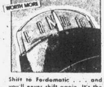
you'll never shift again. It's the finest, most versatile automatic drive ever. Ford also offers the smooth, thrifty Overdrive