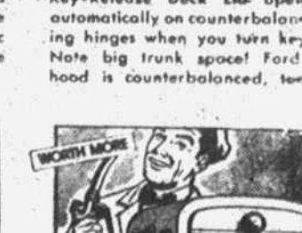
ing hinges when you turn key Note big trunk space! Ford's

high-compression Mileage Maker Six only modern Six in its field.