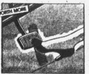
Power-Prvot Pedals, suspended from above, operate more eas-