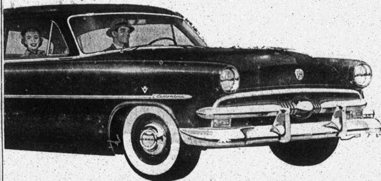
NEW FORD ON DISPLAY FRIDAY — Pictured above is a front end view of the new 1953 Ford which will go on display at Plonk Motor Company showroom here Friday morning.