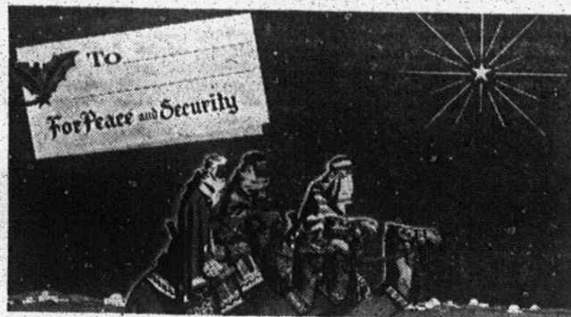
This colorful gift jacket for Defense Bond Christmas presents is available free of charge at most banks and some post offices. Ask for your free Defense Bond gift jackets early.