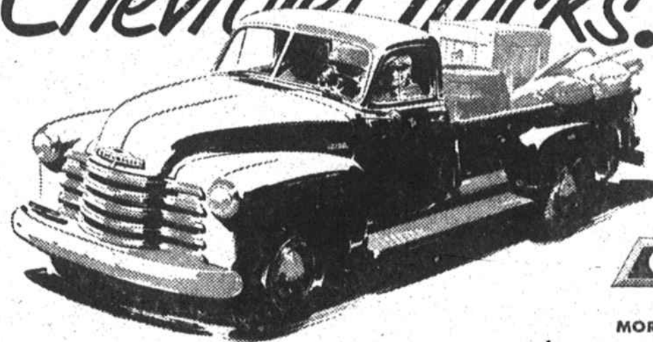
From light delivery to heavy hauling, there's a Chevrolet truck to fit your needs.