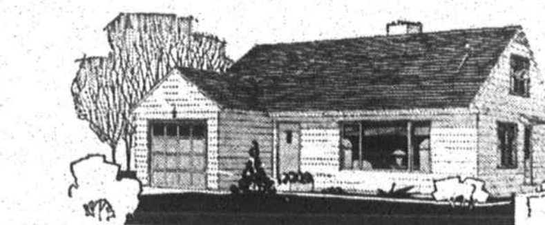
A SMALL HOUSE PLANNING BUREAU DESIGN NO. D-274