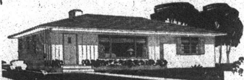
A SMALL HOUSE PLANNING BUREAU DESIGN NO. B-322