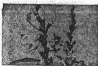
OBEDIENT-PLANT

This plant grows wild in waste places and along banks of streams where there is some dampness from New Brunswick to Maryland and west to Minnesota and Missouri with the range extending south in the highlands of North Carolina and Tennessee. In some places the