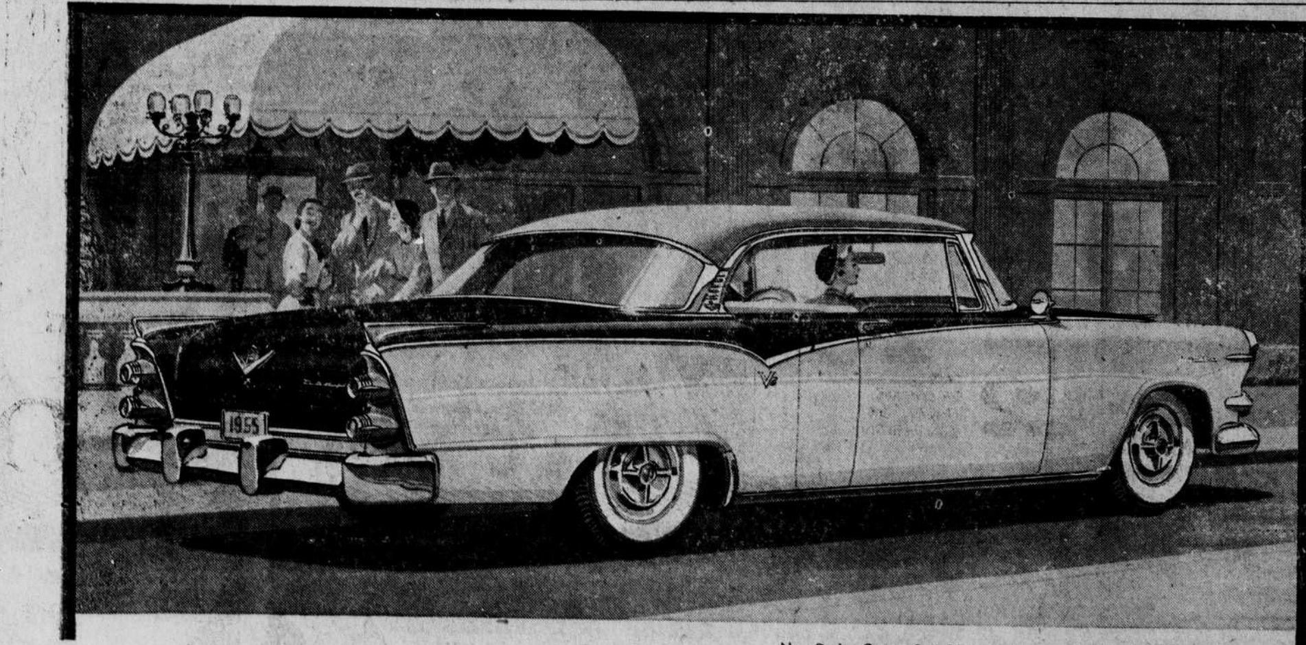
New Dodge Custom Royal Lancer—the most beautiful hardtop on the road!

MYERS' DEPT. STORE WE GIVE S & H GREEN STAMPS