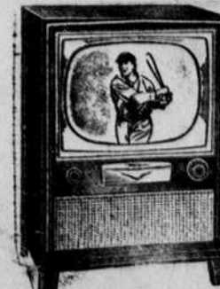
RCA Victor 21-inch "521" Mahogany grained finish. Model 21S521. $339.00

You've never dreamed TV reception could be so clear... sharp... steady!