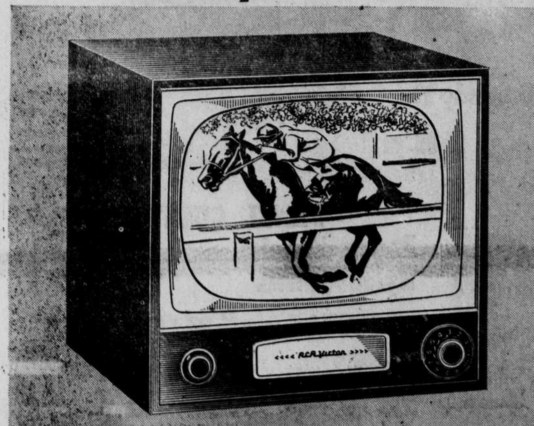
RCA Victor 17-in. Trent. Ebony finish. Matching "Roll Around" stand available, extra. Model 17S450.