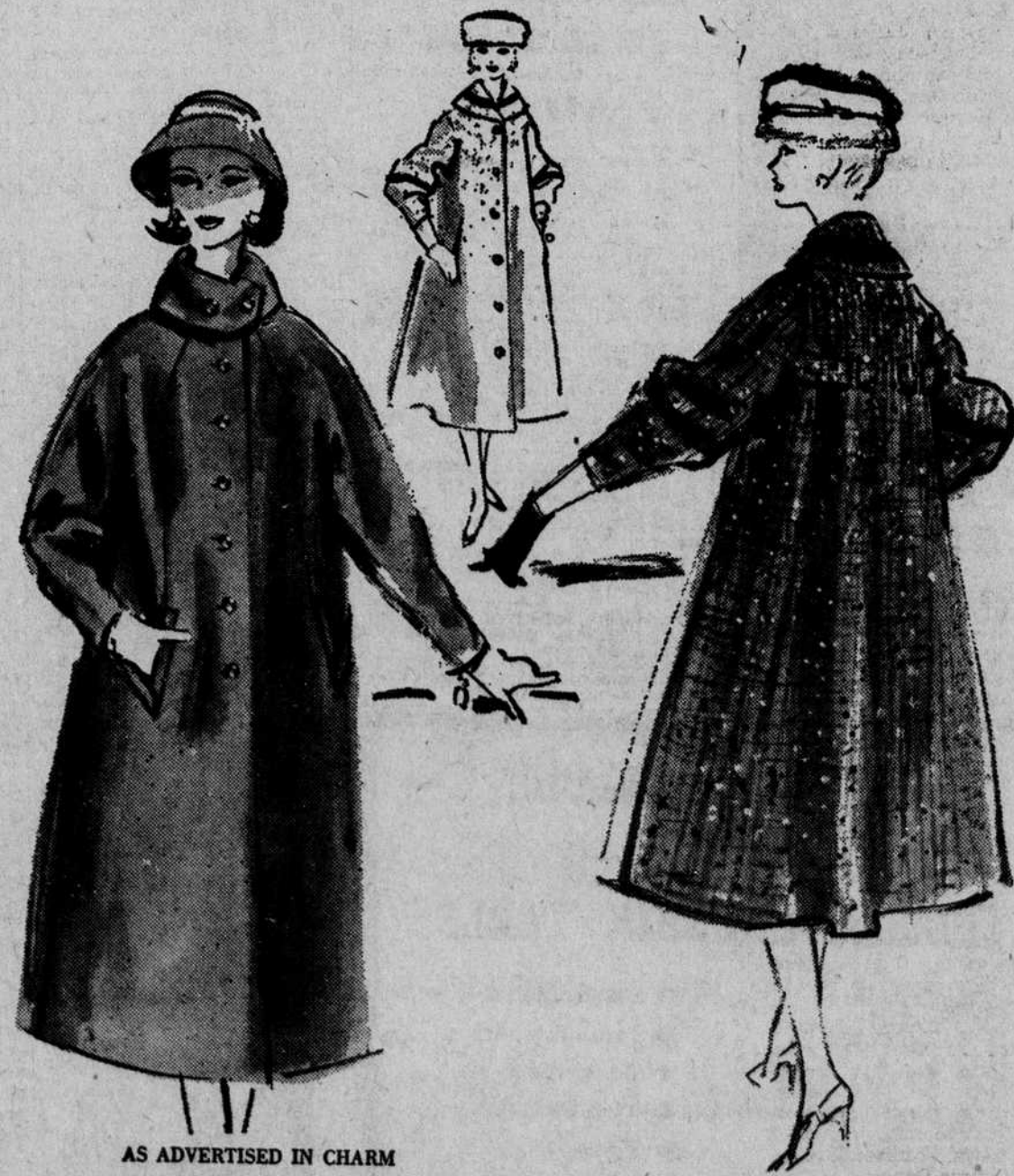
AS ADVERTISED IN CHARM

Choose your new look from coats like these