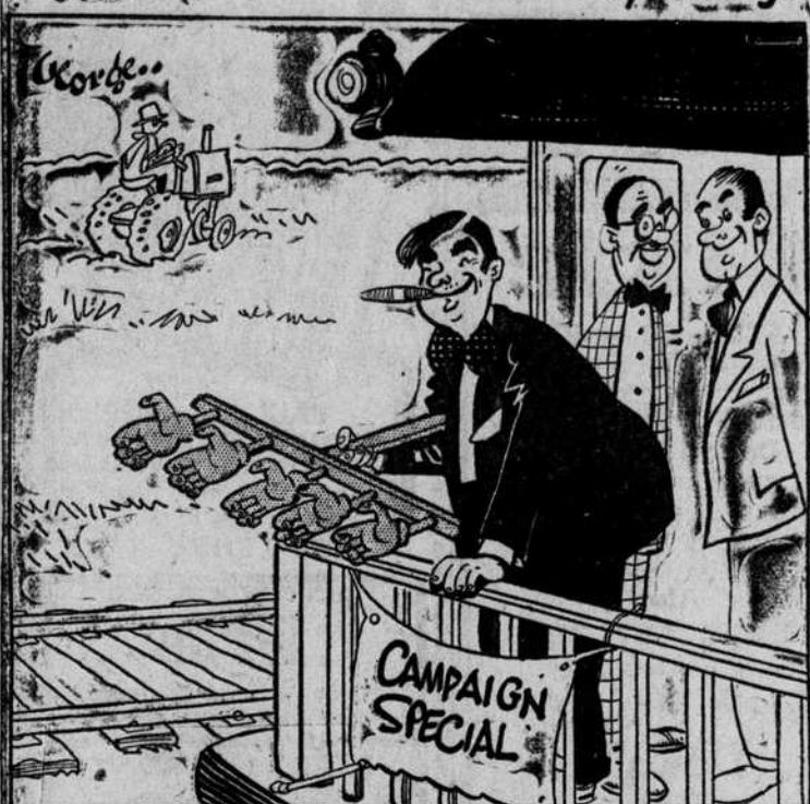
"The Senator expects to shake hands with a lot of people, and he doesn't want to miss anybody!"