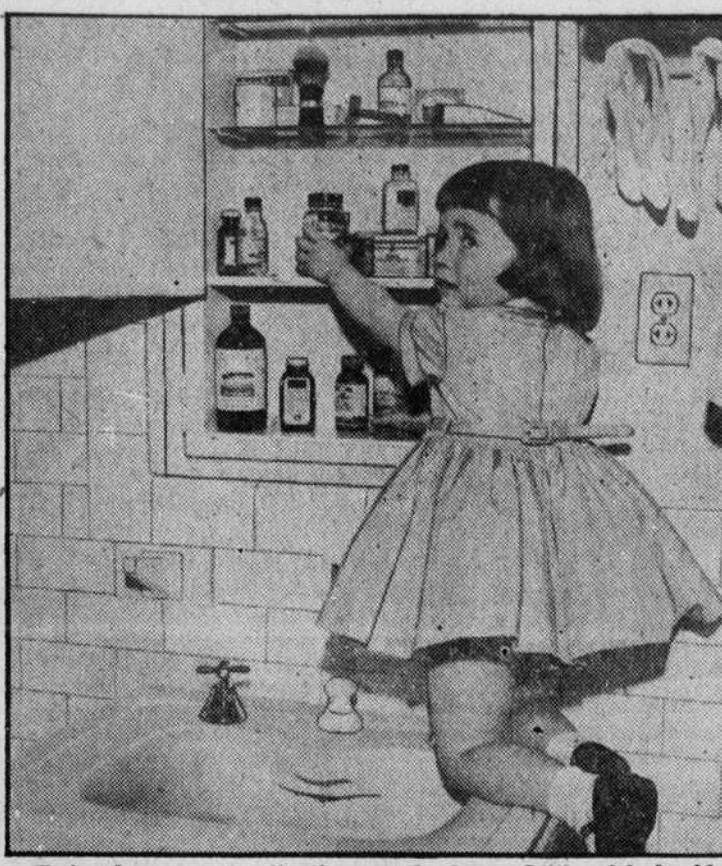
Twice dangerous is situation posed, above. Little girl should be discouraged from "mountaineering" and YOU should keep all drugs, strong medications under lock and key ALWAYS..

It's used for insect bites and poison ivy as well as for cuts and scratches.