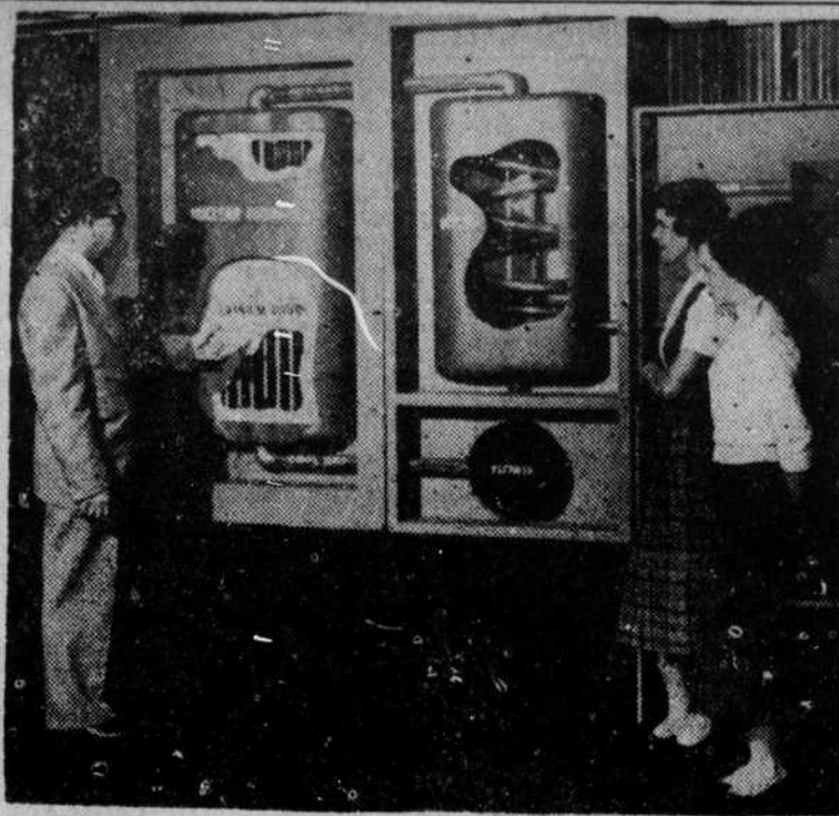
ATOM DISPLAY EXPLAINED —These two young ladies are getting an examination of the atomic energy display pictured above. This display will be one of the more interesting exhibits at the Spindle-Center Fair, which is being held Sept. 10-15.

The Roberson reunion was held at Hickory Grove, S. C. Sunday afternoon.