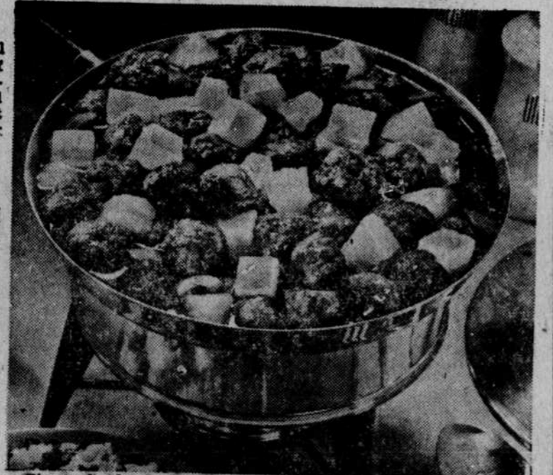
Pineapple chunk sauce over small tenderized meat balls lends a different, enticing flavor to the summer meal. Serve with fluffy rice.

Meanwhile, simmer together about 15 minutes the bouillon, pineapple, and syrup, green pepper, vinegar, sugar, soy sauce,