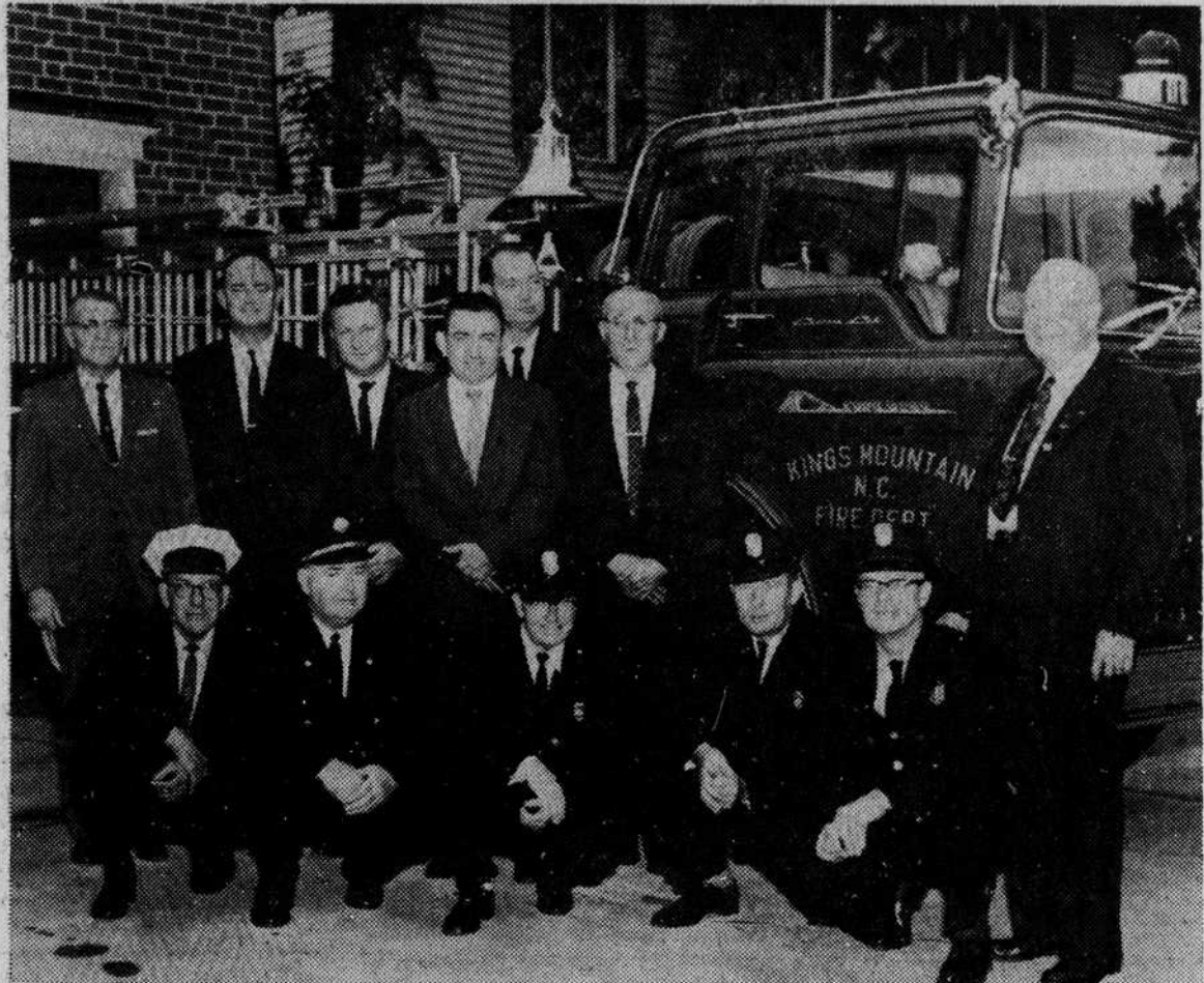
CITY PUTS NEW FIRE WAGON IN SERVICE—Kings Mountain has just put into service a new $16,000 American LaFrance fire truck...