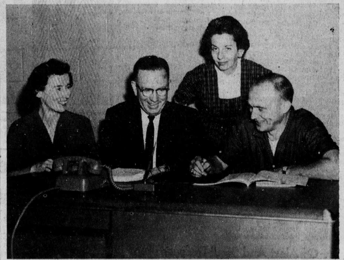
OPEN HOUSE PLANNED—Southern Bell Telephone Company will hold open house Thursday in its new building at 208 W. Mountain St. Pictured above, Bell officials, map final plans for the event to be held from 6 until 10