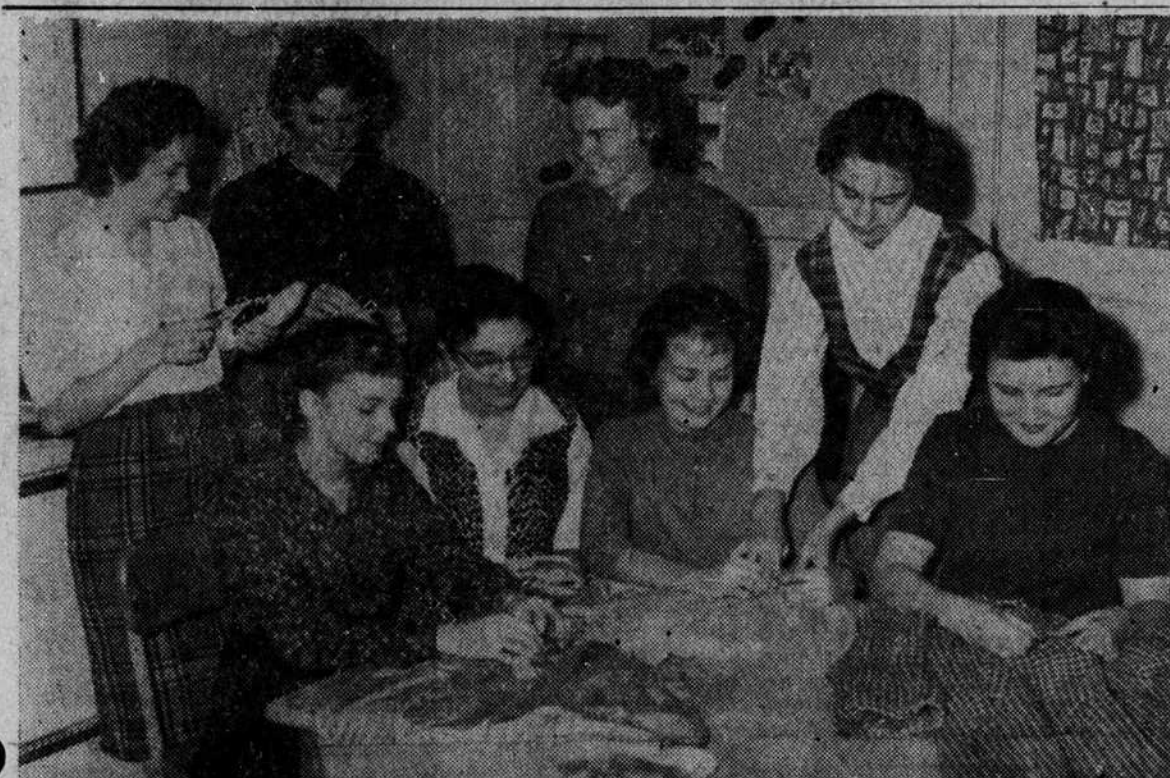
HELP TO SPREAD CHRISTMAS CHEER — Members of the high school Future Homemakers club are pictured as they mend garments for the children's clothing closet. The club is collaborating with the Junior Woman's

Club to provide a merrier Christmas for the community's needy. Other churches and civic organizations are also at work this week to take Christmas cheer to the indigent.