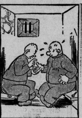
"No, Herschel, I can't find anything in your future that says you're going to travel!"