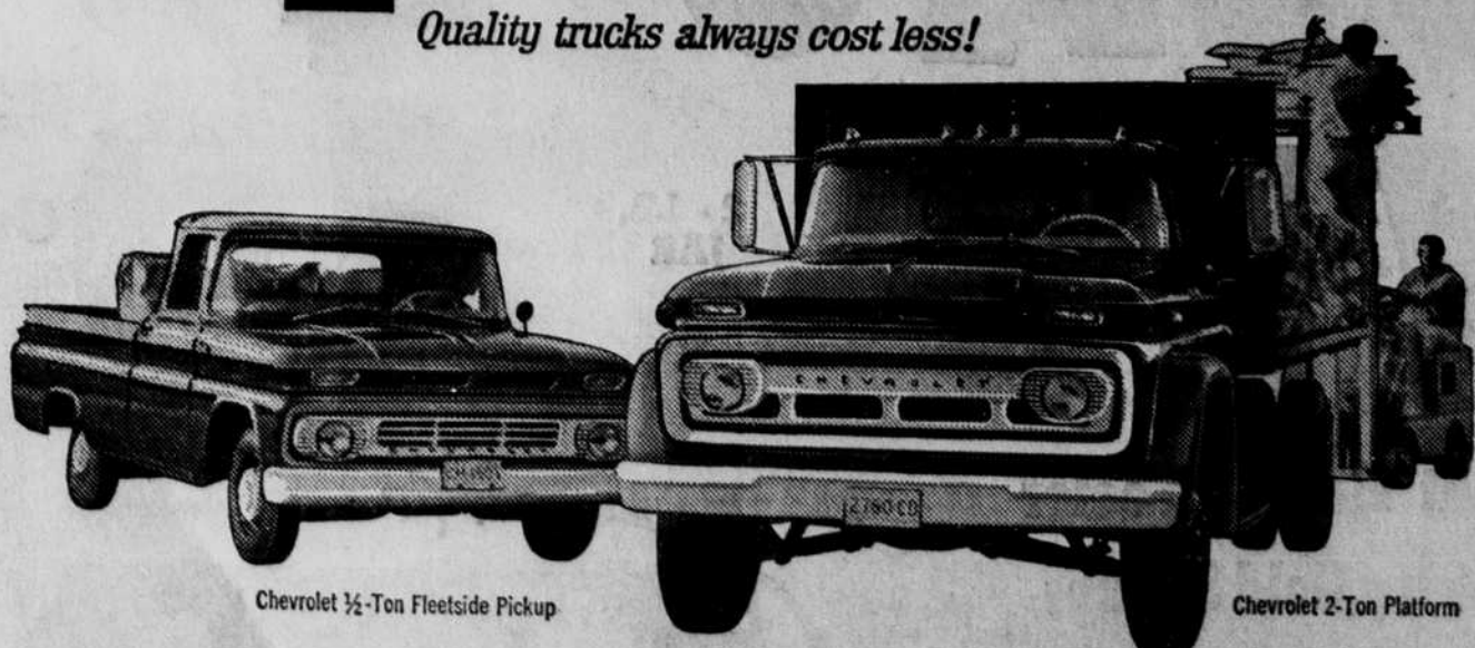
Chevrolet 1/2-Ton Fleetside Pickup