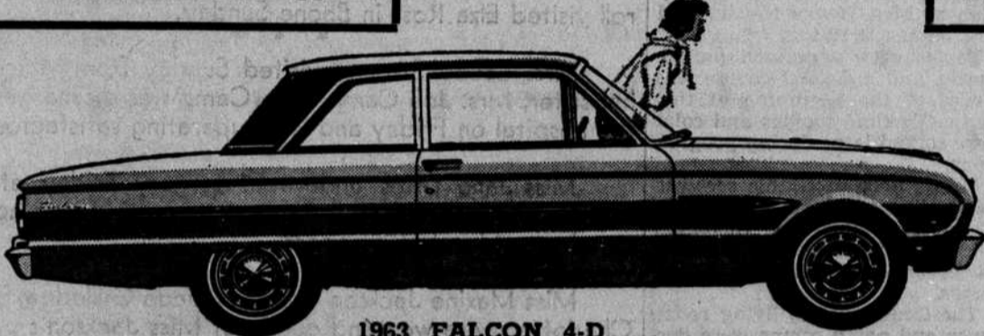
1963 FALCON 4-D

ALL FACTORY STANDARD EQUIPMENT, INCLUDING HEATER AND DEFROSTER. FREIGHT ONLY EXTRA. N. C. SALES TAX