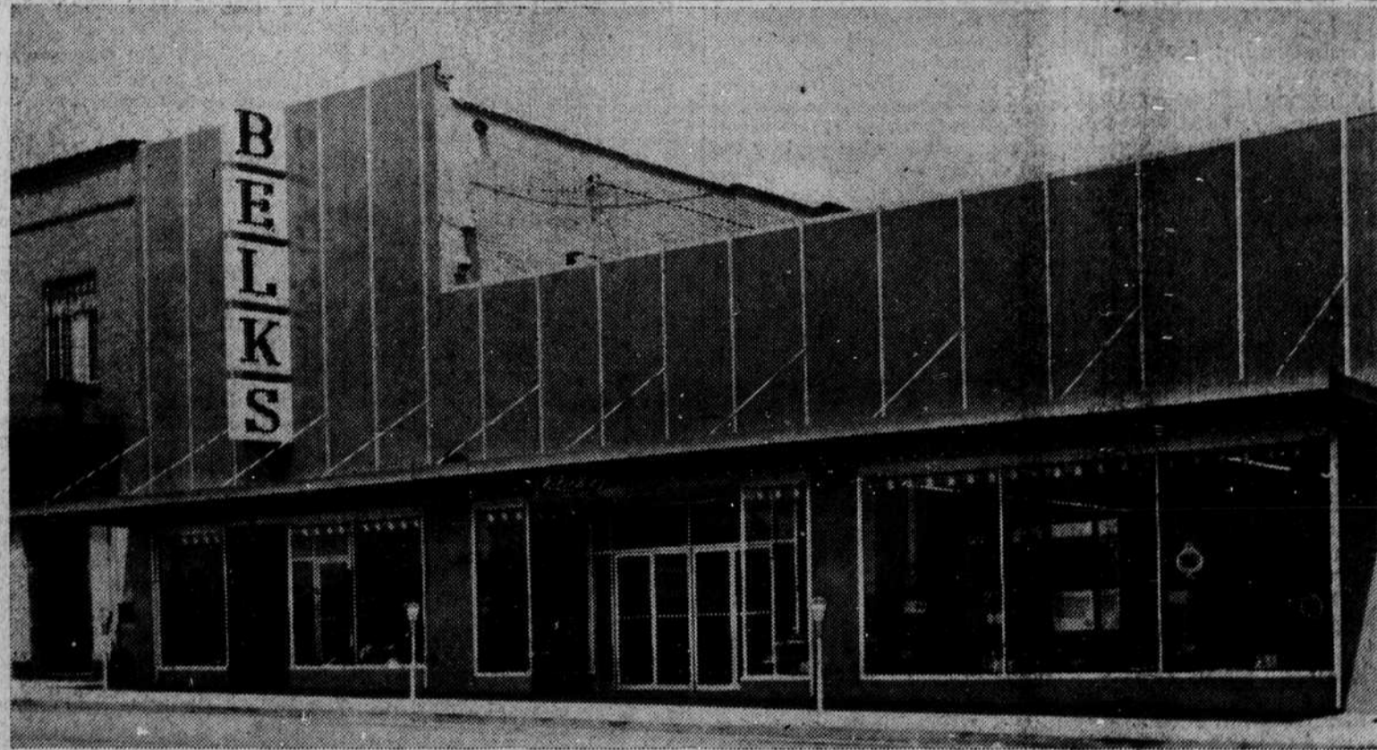
BELK'S MODERNIZES — Belk's Department Store is still completing interior remodeling, though structural changes in the building, including installation of the modern store front pictured, is complete. Green aluminum panels are accentuated by the standard aluminum struts supporting the building-long marquee, while the lighted signs stand out with red lettering on a white background.