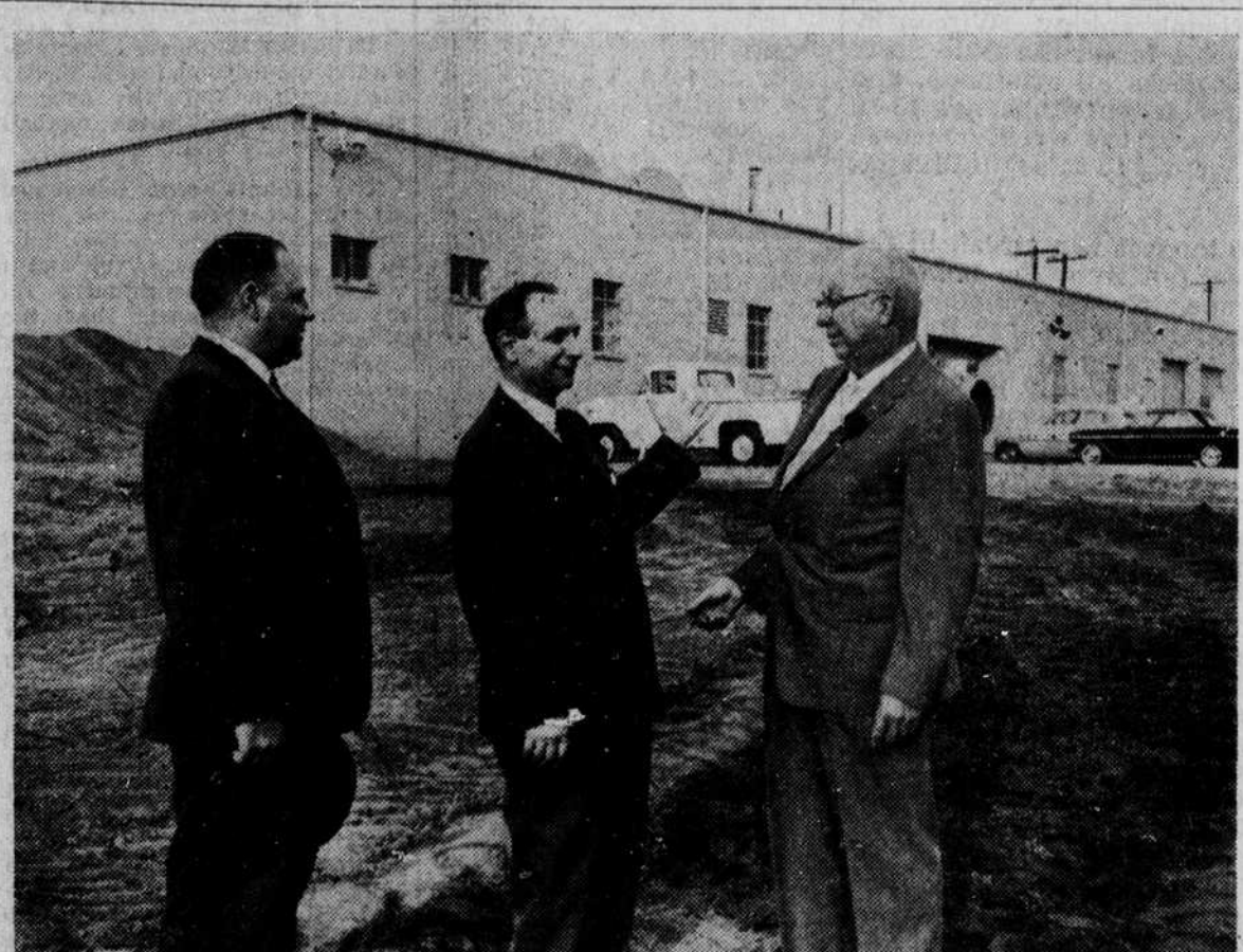
MANUFACTURER IN MAJOR EXPANSION - Ground was broken recently for a 33,000 square foot addition to Duplex-Shannon, Ltd., a new firm resulting from the merger of Kings Mountain's Shannon, Ltd., and New York's Duplex International. Pictured at the construction site with the

1954. He was president of the Western Conference of the Lutheran Church for seven years and a member of the Board of World Missions of the United