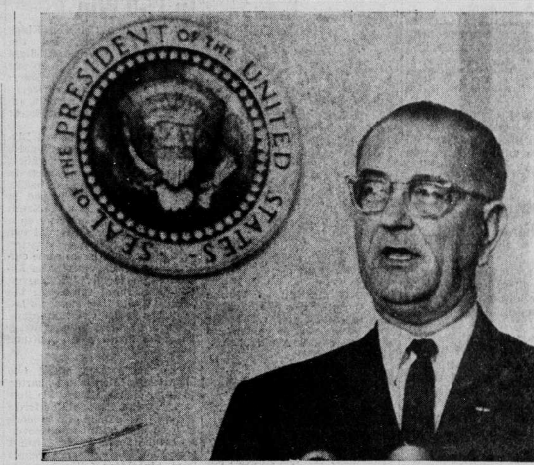
PRESIDENT OF THE UNITED STATES — Lyndon Baines Johnson became the 36th President of the United States on Friday, November 22. A Texan, he is the first Southerner to hold the office since Andrew Johnson, a native North Carolinian, was succeeded by Ulysses S. Grant in 1869. Andrew