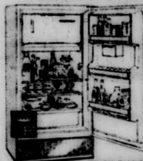
Model D-12-64 11.00 cu. ft., 4 colors or white!